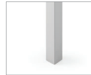
Square 4" Silver