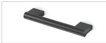
Square edge Black