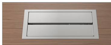
Power block (closed)