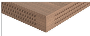
1.5" with fluted edge