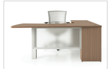
Modesty (glazed shown)