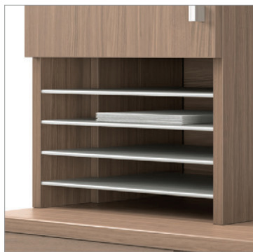
Collator option is available in Black or Brushed Cobalt finish