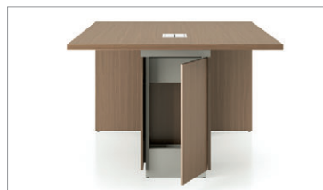
Easy access to wire management