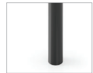
Round 4" or 5" Black