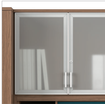
Glazed doors available in two glazing options with Silver frames