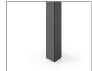
Square 4" Black