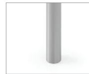
Round 4" or 5" Silver