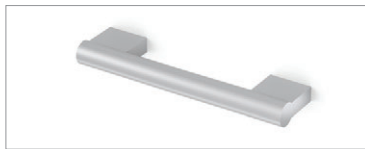
Square edge Silver