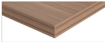
1" with bicut edge