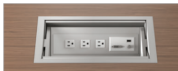
Multiple power block configurations available (open)